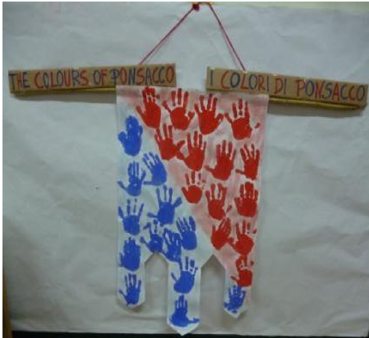
The BANNER of Ponsacco